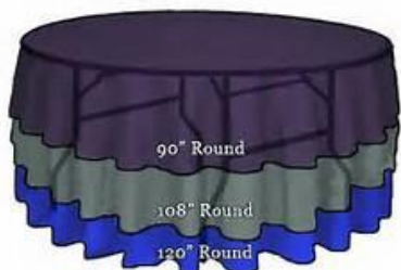
60" Round Table